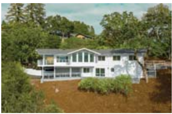
48 Via Floreado, Orinda | $2,495,000 48viafloreado.com