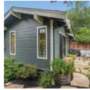
3 Josefa Place, Moraga | $789,000 3josefa.com