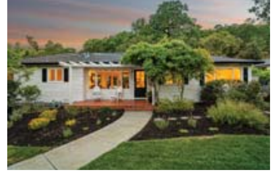
3357 Springhill Road, Lafayette | $2,495,000 3357springhill.com